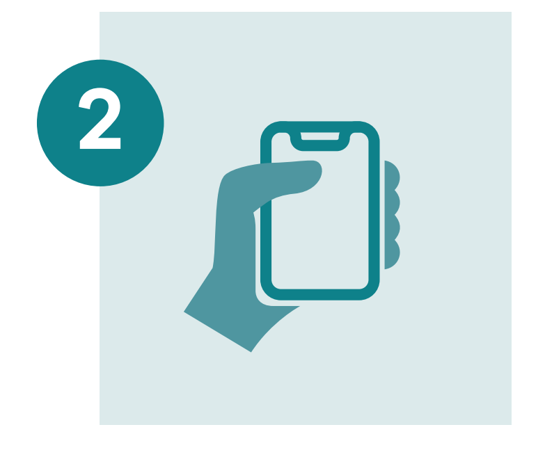
Enter your first name and phone number