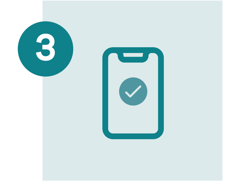
Look for the tick You're now checked-in