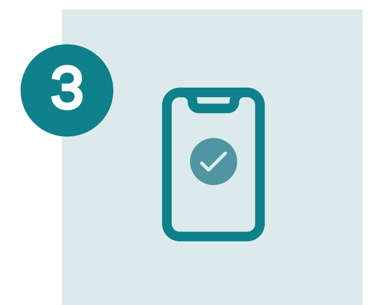
Look for the tick You're now checked-in