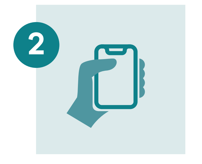
Enter your first name and phone number