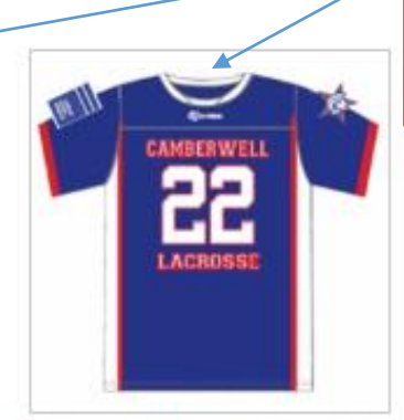
Camberwell LAX PI Top $44.00 AUD inc GST