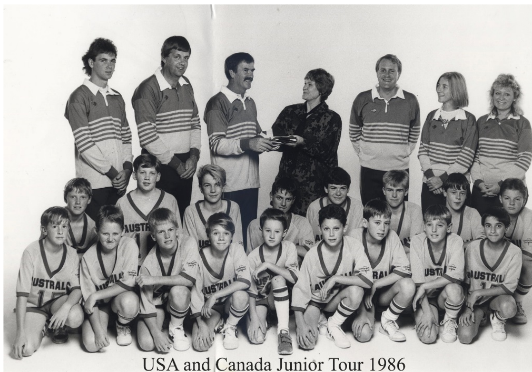
USA and Canada Junior Tour 1986