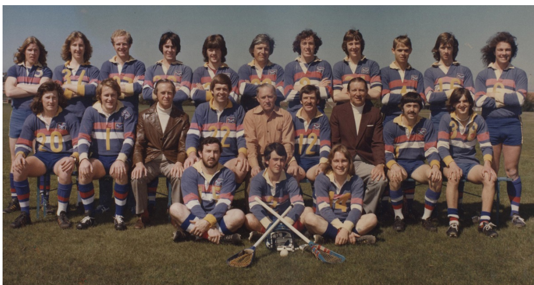
CAMBERWELL GLEN IRIS "A" RESERVE PREMIERS - 1977